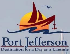
Sponsored and Paid for by the Port Jefferson Business Improvement District